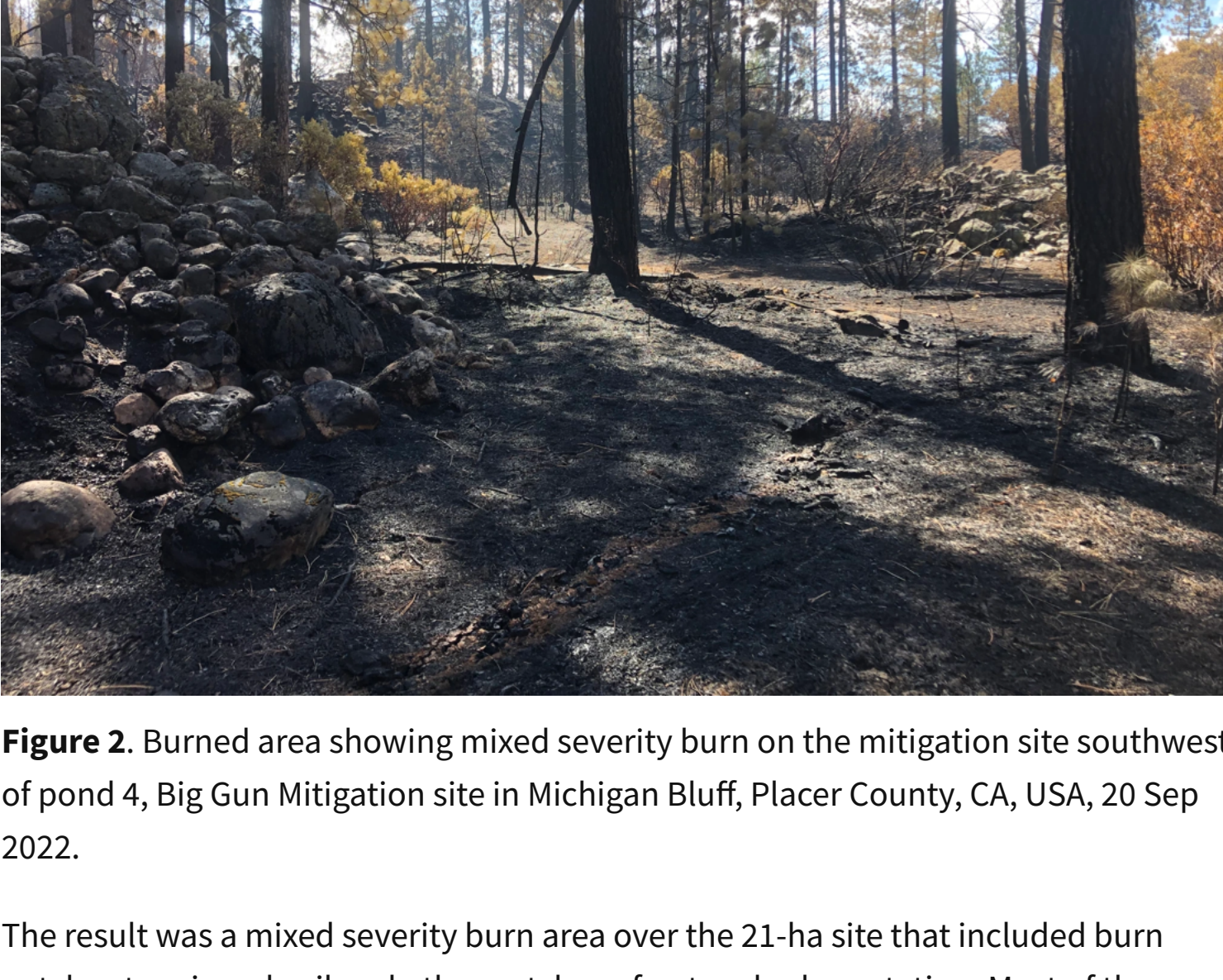
Figure 2. Burned area showing mixed severity burn on the mitigation site southwest of pond 4, Big Gun Mitigation site in Michigan Bluff, Placer County, CA, USA, 20 Sep 2022.

The result was a mixed severity burn area over the 21-ha site that included burn patches to mineral soil and other patches of untouched vegetation. Most of the existing inundated ponds experienced fire to the wet edge on 50% or more of the shoreline (Fig. 3).