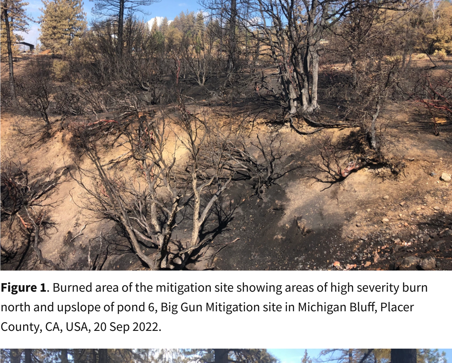
Figure 1. Burned area of the mitigation site showing areas of high severity burn north and up slope of pond 6, Big Gun Mitigation site in Michigan Bluff, Placer County, CA, USA, 20 Sep 2022.

On 6 September 2022, a fire ignited at Mosquito Road, near Oxbow Reservoir in Placer County, CA, USA approximately 4.2 km south-southwest of the mitigation site. Due to extensive stressed-killed trees, drought conditions, and a northeasterly wind, the mitigation site was burned over within one day of the initial ignition. The fire encompassed an area of approximately 31,200 ha within two counties. Although the burn severity maps were not complete at the writing of this report, on-the-ground assessments by the authors on 26 September 2022 suggested high severity burned areas mixed with completely unburned areas (Figs. 1, 2).