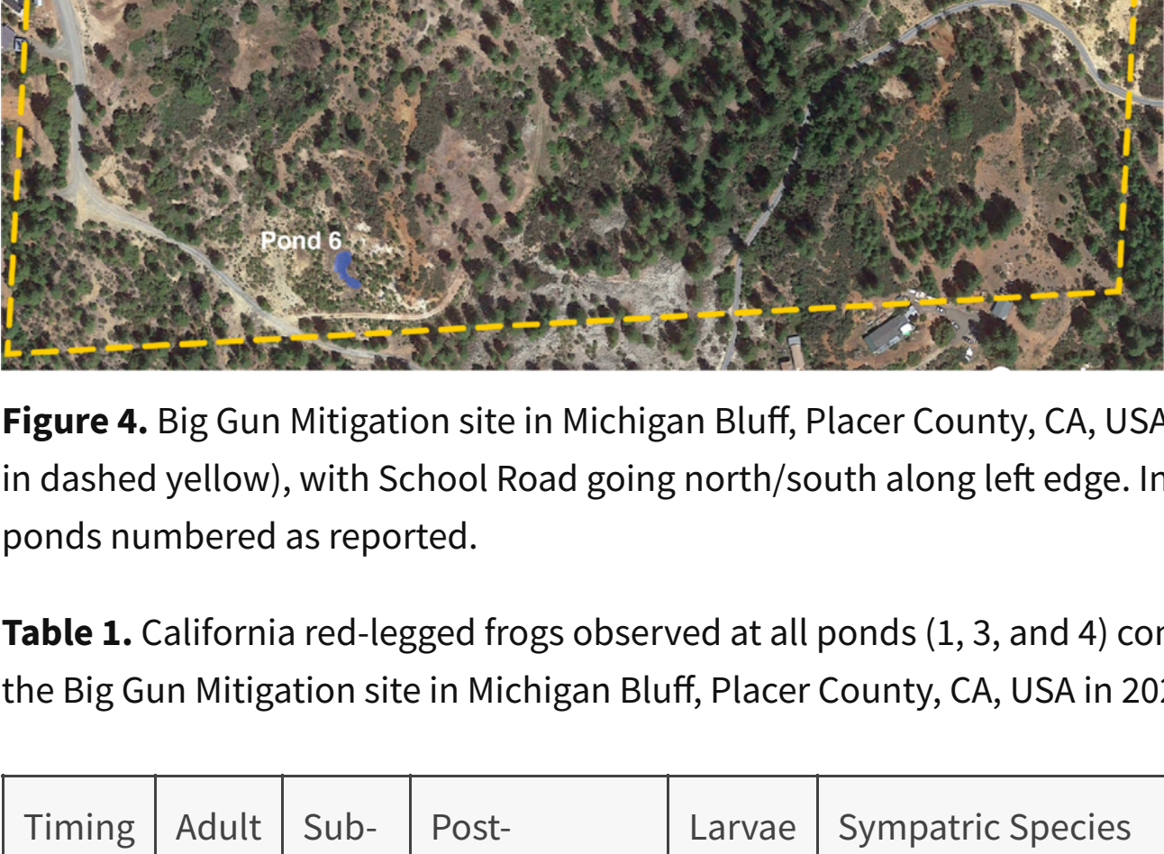
Figure 4. Big Gun Mitigation site in Michigan Bluff, Placer County, CA, USA (outlined in dashed yellow), with School Road going north/south along left edge. Individual ponds numbered as reported.

In June 2022, we found 22 adult, 2 subadult, and 230 larval California red-legged frogs inhabiting Ponds 1, 3, and 4; (Fig. 4). Numbers of animals detected varied by pond (Table 1). During our post-fire surveys in September of 2022, we observed >300 California red-legged frogs in ponds 1, 3, and 4 (Table 1).